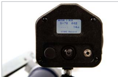
LED display and sensitivity dial