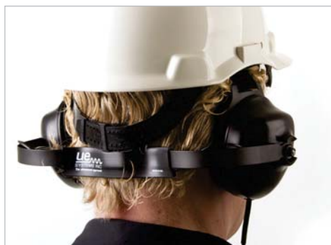
Headset for hardhat use