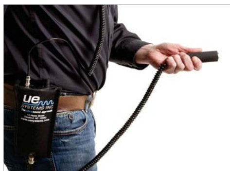
Holster for UP401