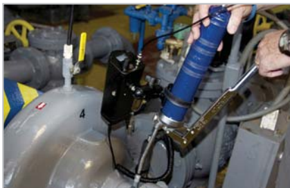
Easily attaches to most grease guns