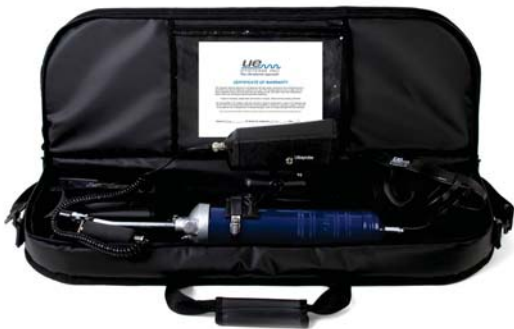
Optional carry case