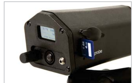
Lubrication data can be stored on the SD card